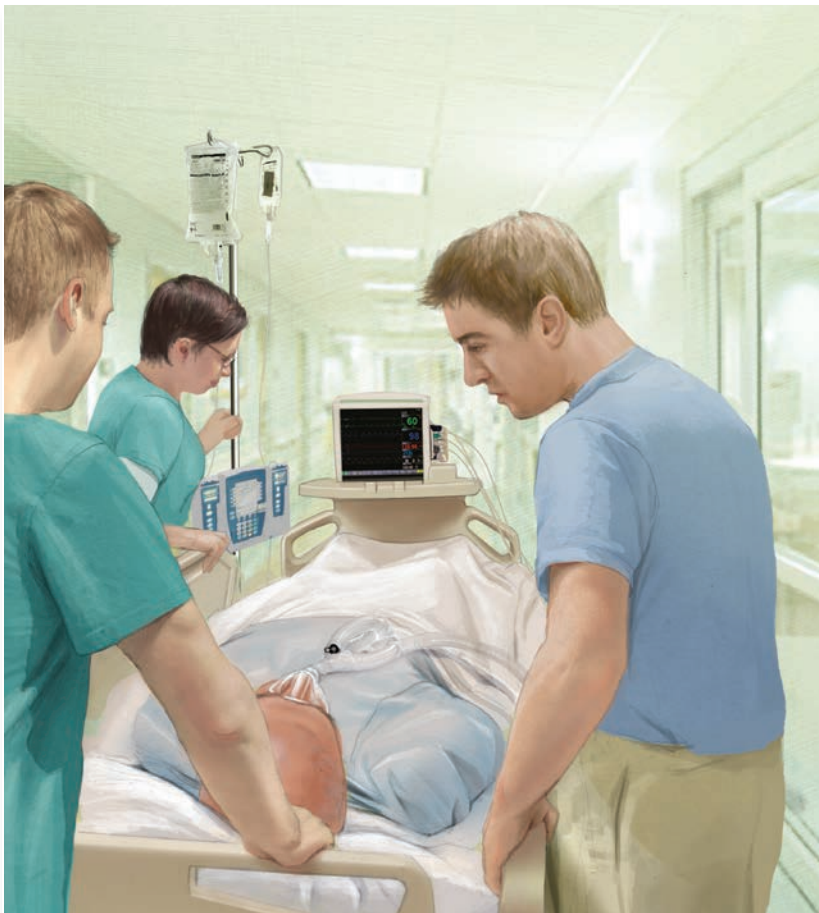
Cover illustration by Kimberly Martens