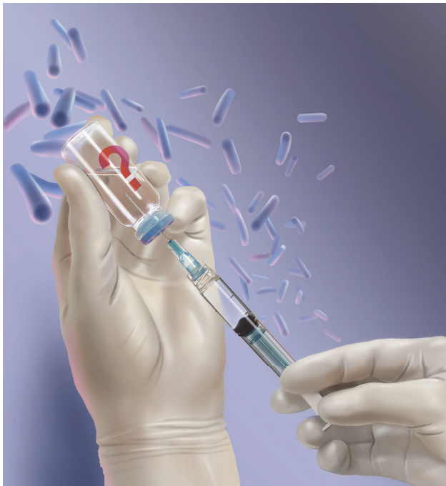
Cover illustration by Kimberly Martens

The journal for high acuity, progressive, and critical care nursing