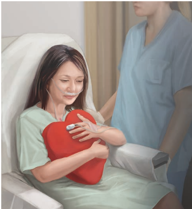
Cover illustration by Kimberly Martens

The journal for high acuity, progressive, and critical care nursing